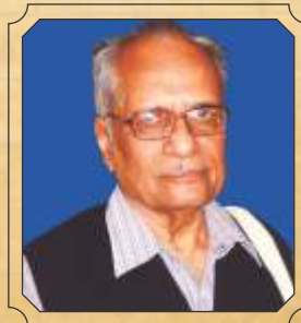
Bibhuti Patnaik (1937) Eminent Novelist, Story Writer & Columnist