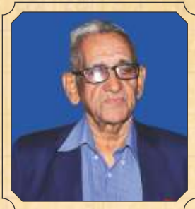
Ramakanta Rath (1934) Eminent Poet & Story Writer