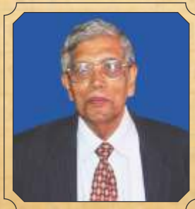
Sitakant Mahapatra (1937) Eminent Poet, Literary critic & Translator