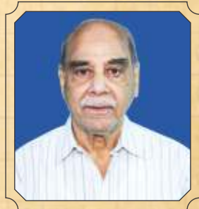
Anant Mahapatra (1936) Eminent Thespian & the renaissance man of Odia theatre