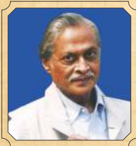
Jagannath Prasad Das (1936) Eminent Poet, Story Writer, Playwright & Artist