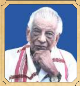
Achyutananda Pati (1927) Eminent Story Writer